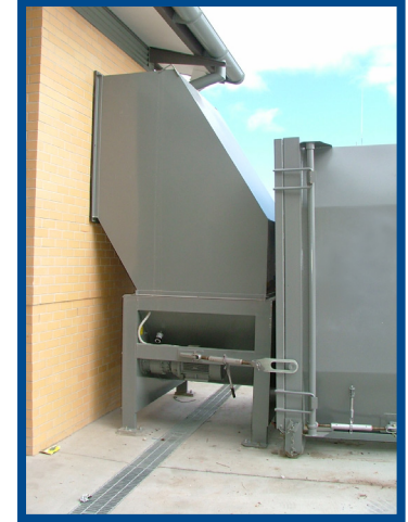
AST-220 Stationary Auger Compactor